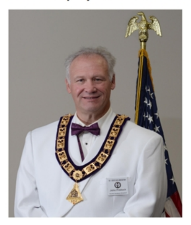
Saturday, June 1st, 2024

Appetizers/Open Bar 5-6pm Dinner at 6pm Choice of Roast Beef or Stuffed Chicken Breast